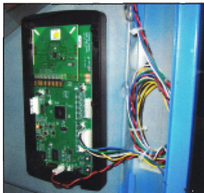
GameAlert requires no cutting or drilling, meaning connections are simple to install.