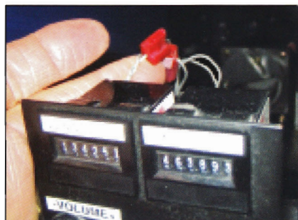
A close look at the connection made at the meters.